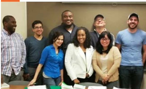
Spotlight on CLASS: Master of Arts in Global Interactions (MAGI)

Five years since its inception, MAGI remains the only program in northeast Ohio designed to meet the growing demand for commercial, political and economic global experts. With a total of 44 graduates, the interdisciplinary graduate program has exceeded expectations. Read More